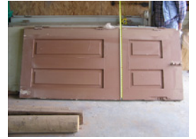
08-15 1 of 4 NE room