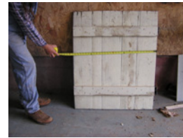
25-49 crawl space(50)