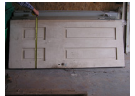
13-25 parish hall to nw