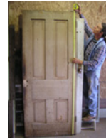
07-14 2 NW room sealed in