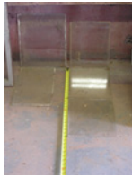
Window Glass 3