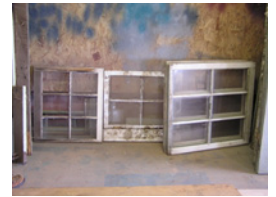
Window Glass 1