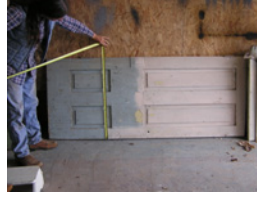
22-43 2 west hall