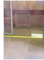
Window Glass 5