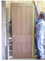
01-02 SE Room 2 Middle North