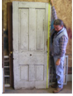
03-06 kitchen leaning on North wall