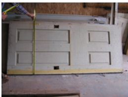
11-21 2 of 4 s to n