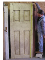
12-24 attic west wall leaned