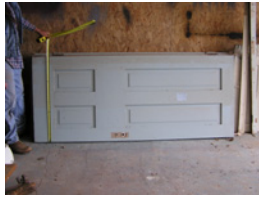
19-37 East bedroom