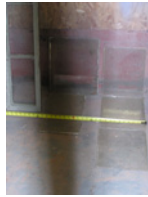
Window Glass 4