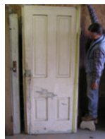
14-28 sw parish hall by shelves