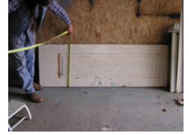
23-45 NW airlock