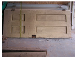
12-23 attic west wall leaned