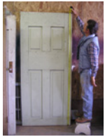
08-16 1 of 4 NE room