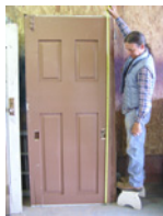
11-22 2 of 4 s to n