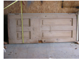
20-39 2nd floor NW room