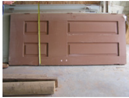
09-17 1 of 4 NE room