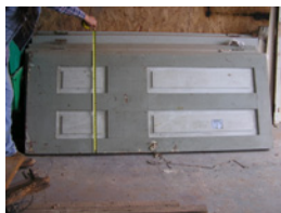
14-27 sw parish hall by shelves