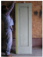
23-46 NW airlock