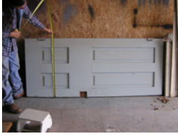
21-41 attic storage