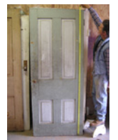
15-30 new kitchen to old