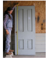
20-40 2nd floor NW room