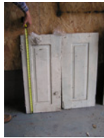
24-48 parish hall cabinet