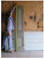
18-36 pantry old kitchen