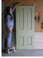
21-42 attic storage