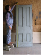
22-44 2 west hall