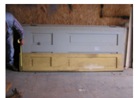
18-35 pantry old kitchen