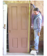
10-20 3 of 4 s to n