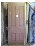
16-32 to basement