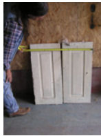
24-47 parish hall cabinet