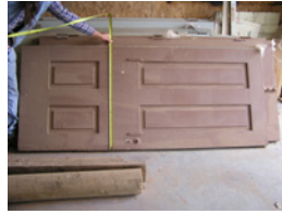
07-13 2NW rm sealed in