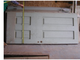
10-19 3 of 4 s to n