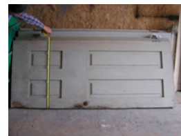
15-29 new kitchen to old