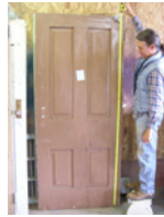
09-18 1 of 4 NE room