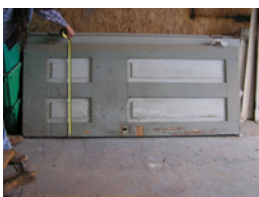
16-31 to basement