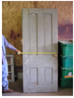
01-01 SE Room 2 Middle North