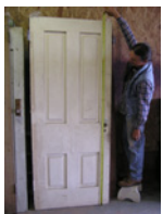
13-26 parish hall to nw