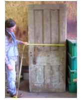
03-05 kitchen leaning on North wall