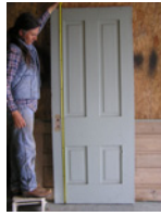
19-38 East bedroom